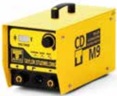
CDM 9 Controller