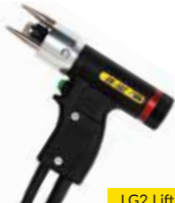
LG2 Lift Gap