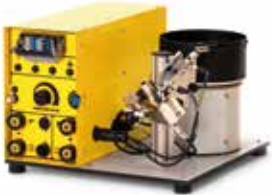
Universal Stud Feed Unit