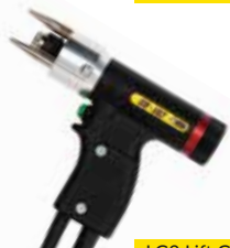
LG2 Lift Gap